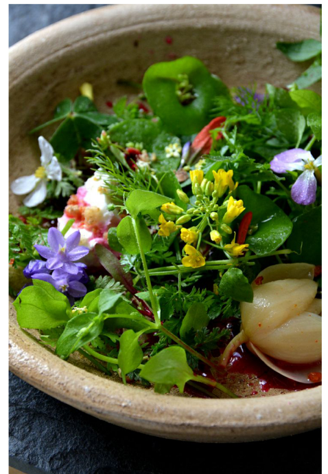
Herb walk through our Gardens - Botanical Salve or Body Butter Making Workshop & Botanical Luncheon ( 2 hours)